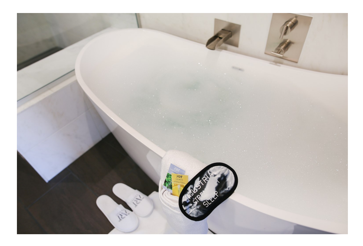
The ART, a hotel; Denver, CO

The Denver art scene is booming, anchored by the Denver Art Museum , the MCA Denver and the overflowing gallery district. Continue your art appreciation into the night at this hotel-cum-museum , with a collection of works by Kiki Smith, Deborah Butterfield, and Sol Lewitt, among other bold-faced names. But it's the tapestry by Ed Rushca—titled Industrial Strength Sleep —that will have the most profound effect on you: Book the hotel's Industrial Strength Sleep Package, and you'll get a silk sleep mask that bears the tapestry's image—plus lemon essential, lavender pillow mist and arguably best of all, a late check-out (1pm).