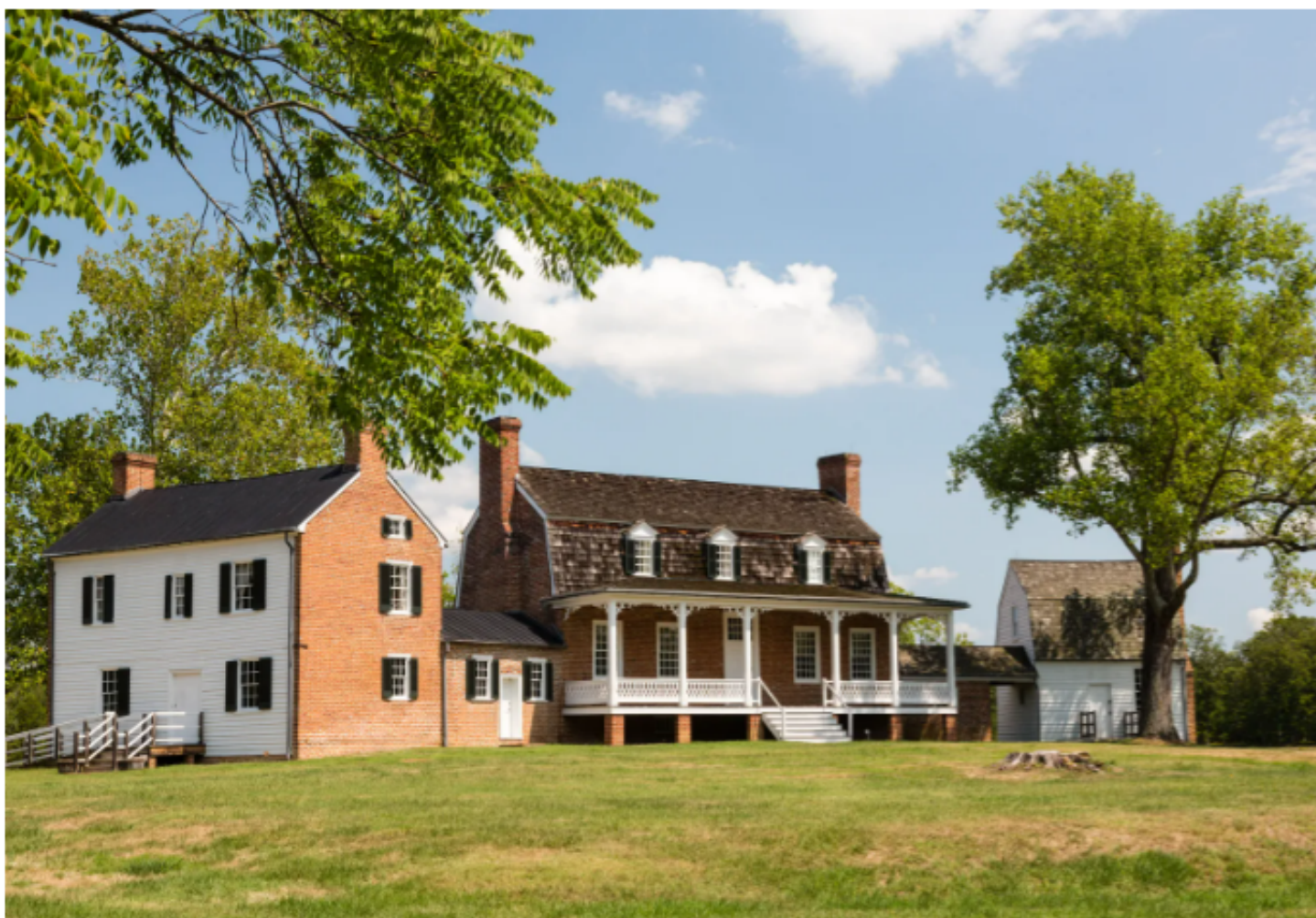
The Haberdeventure, or Thomas Stone House, is a National Historic site in Charles County.