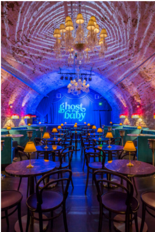
Subterranean bar & music hall Ghost Baby revives the spirit of one of Cincinnati's prohibition-era lager tunnels. Ghost Baby