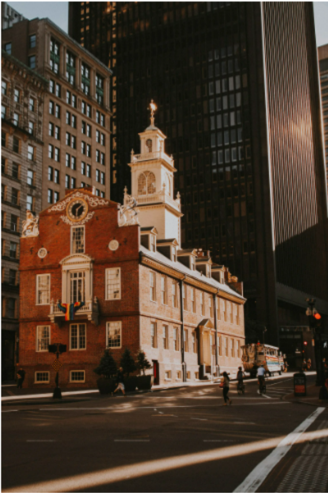
Downtown's Old State House, built in 1713, is the oldest public building in Boston.