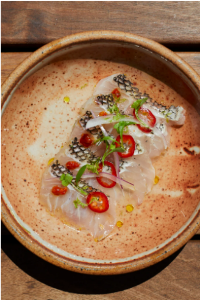
At Faccia a Faccia, a new coastal Italian restaurant on Newbury Street, fresh crudos are served. Elizabeth Cecil