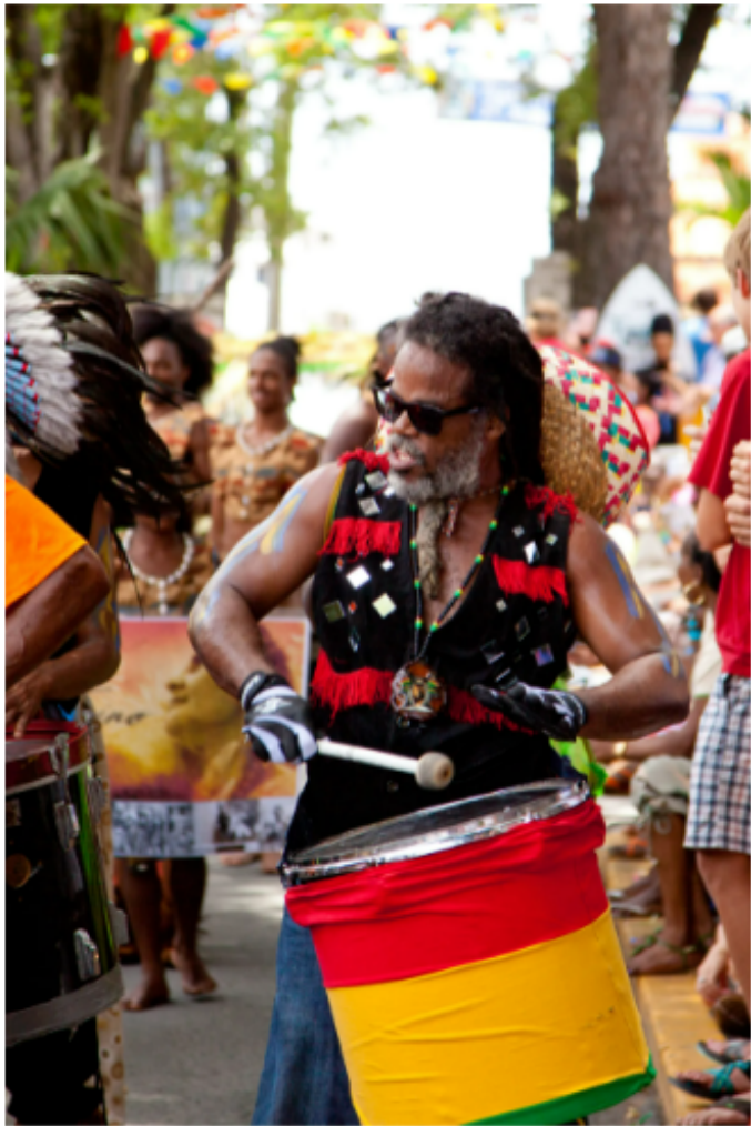
The U.S. Virgin Islands will have three separate Carnival celebrations in 2023.