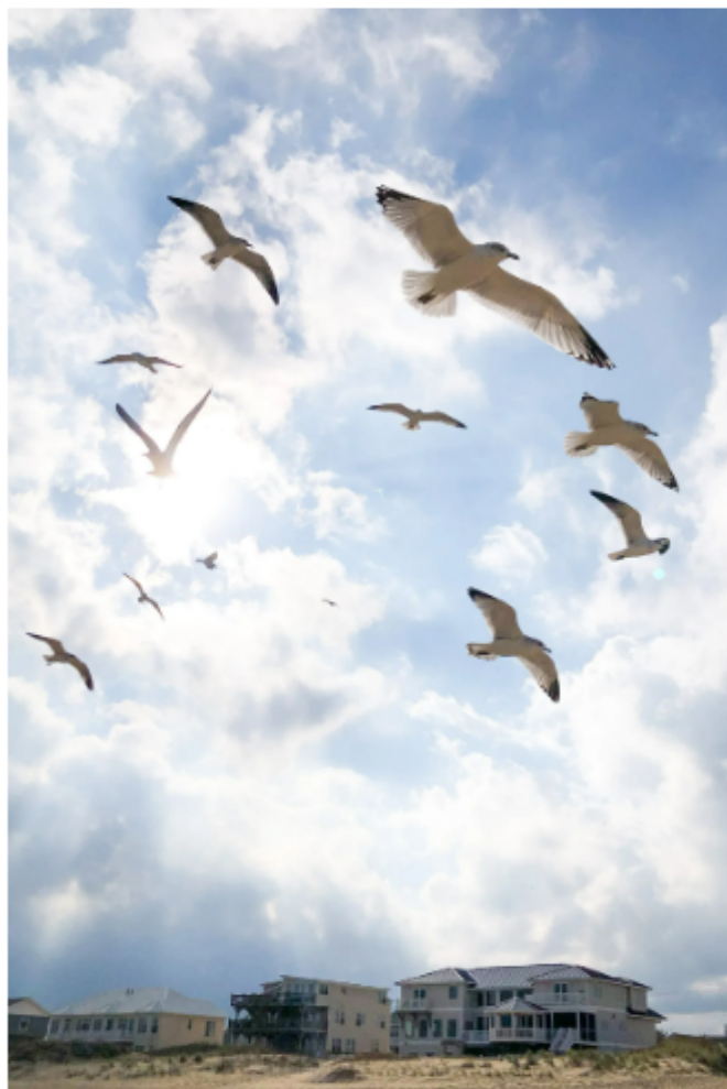
Seagulls over Virginia Beach, home to Chesapeake Bay blue crabs and hand-crafter spirits.