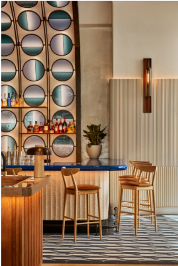
Zaytinya, José Andrés' Mediterranean restaurant is now open at The Ritz-Carlton New York, NoMad.