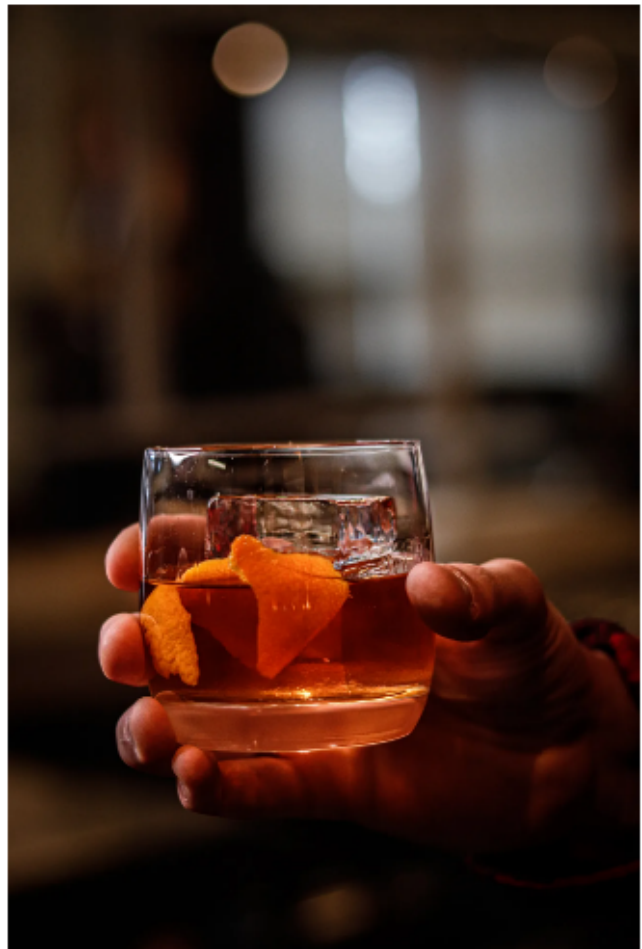
At in Newport, Kentucky, bourbon has been made in-house since 2014.