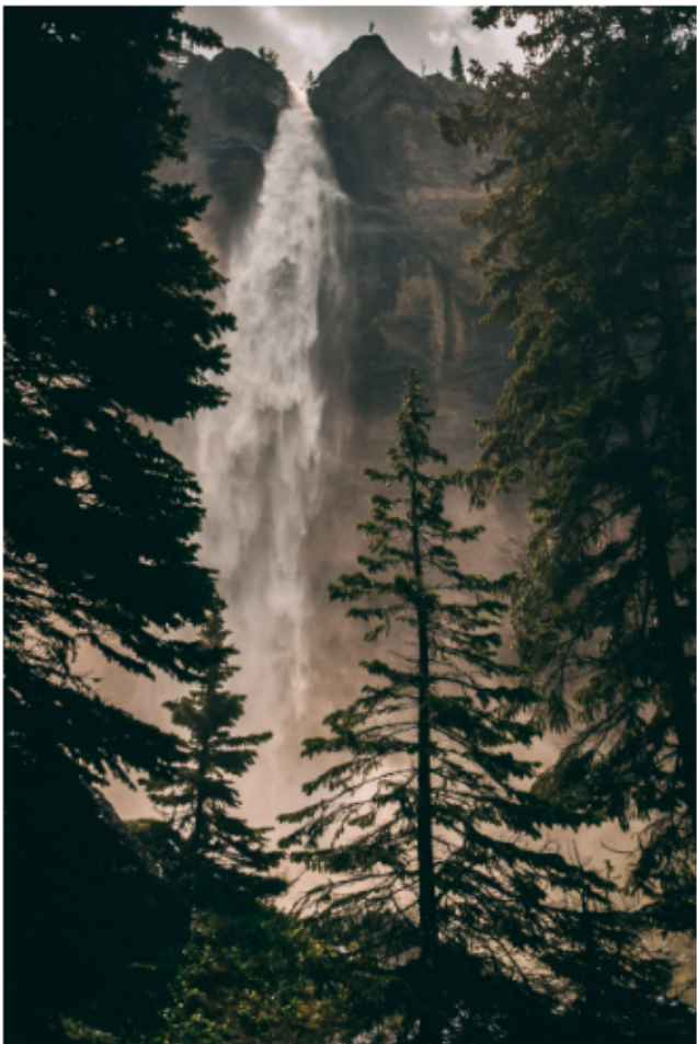
Bridal Veil Falls in Telluride is one of the natural draws of this beloved destination.