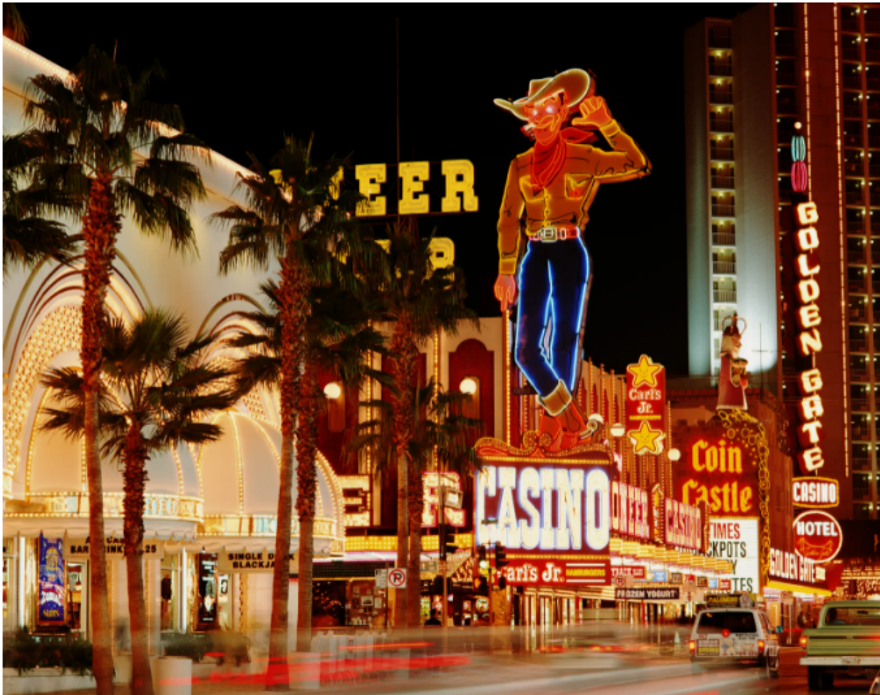
In November 2023, Vegas will host the new Las Vegas Grand Prix—making it one of just three U.S. cities to do so.