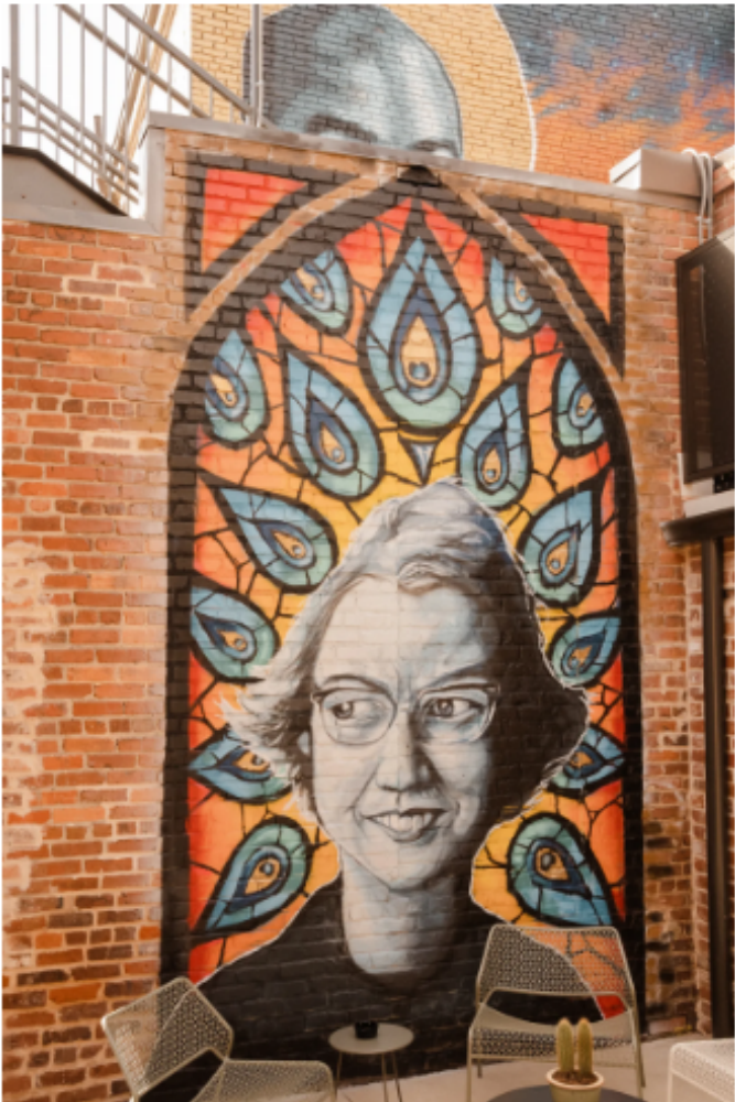
A mural greets visitors at The Woodward Hotel, which opened in downtown Macon this fall.