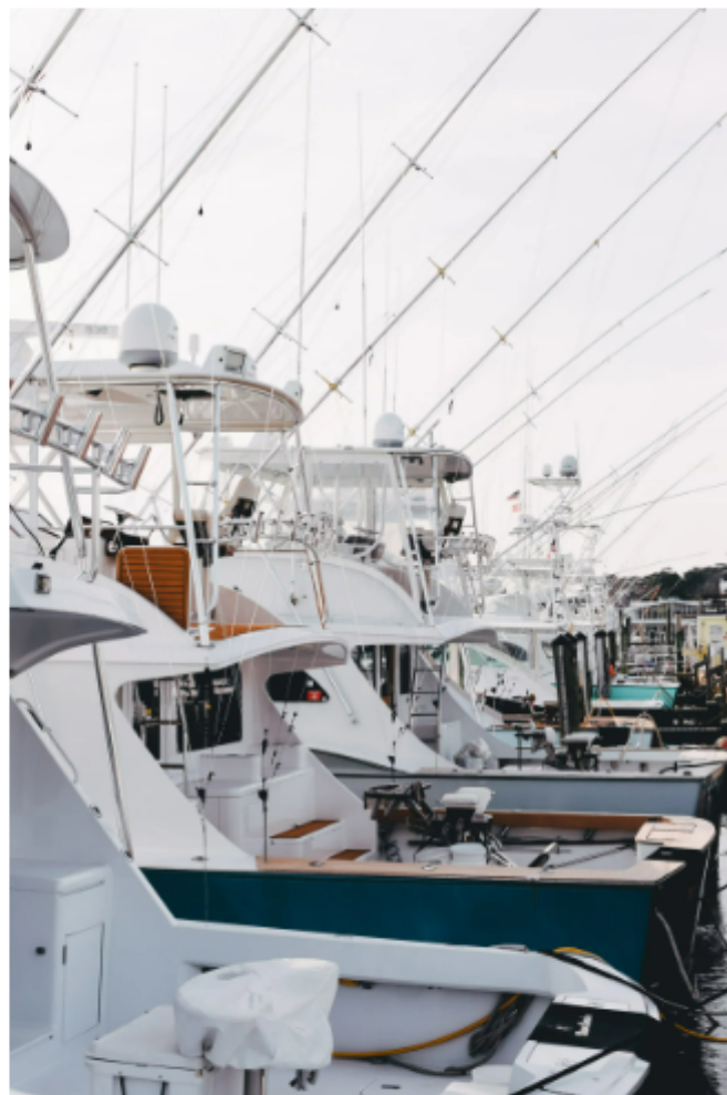
New surf and extreme-sports competitions will come to Virginia Beach in 2023.