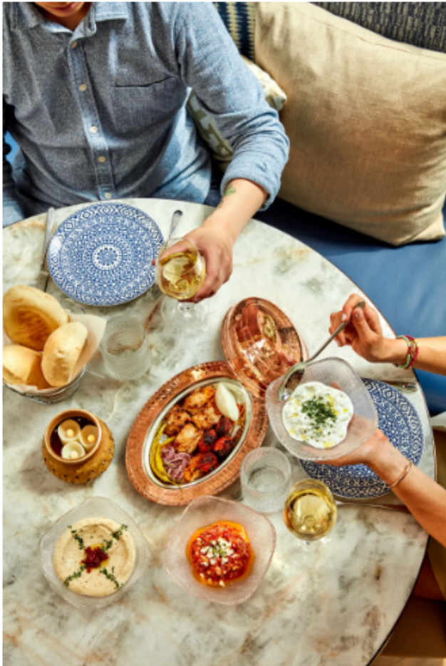
Mezze dips and shish taouk skewers are served at Zaytinya.