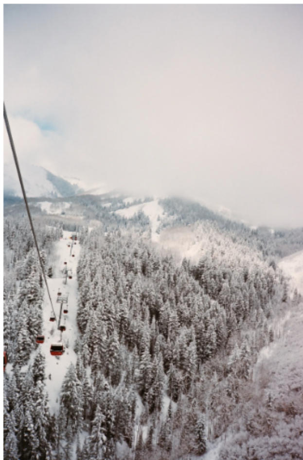
Park City will court skiers and non-skiers alike this season thanks to new après-ski options and the return of Sundance Film Festival in January.