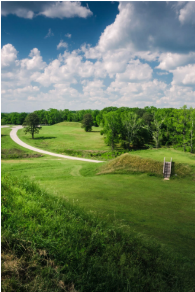
Prehistoric mounds at Ocmulgee Mounds National Historical Park were constructed around 900 CE.