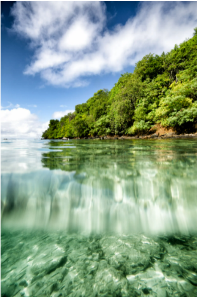
Tranquil St. John is home to the Virgin islands National Park.