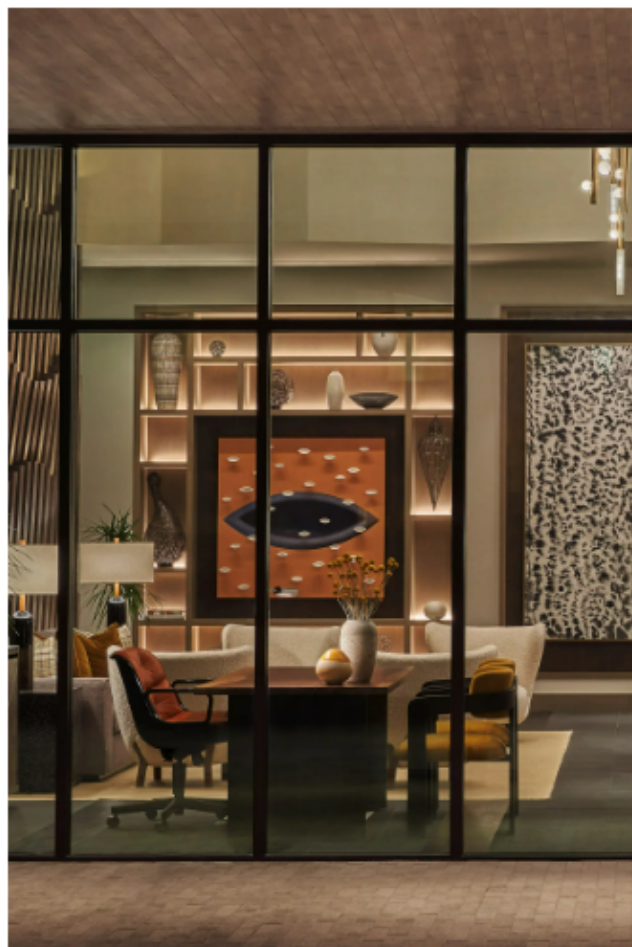
Pendry Park City, with its warm interiors, have joined the Canyons Village resort area. Pendry Park City