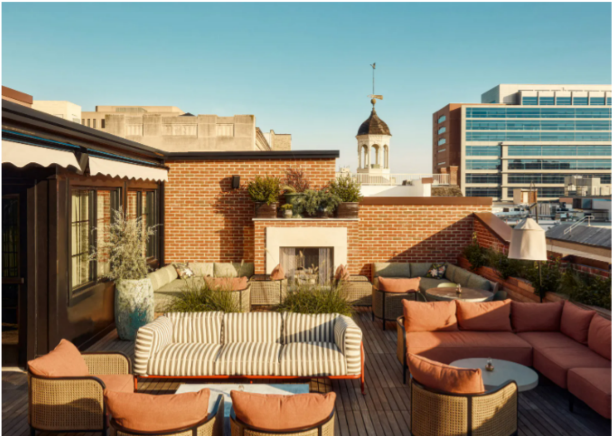
The Quoin Hotel is Wilmington's first boutique hotel.