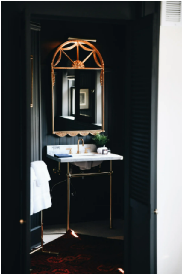
The Truitt, an eight-room Kansas City property, focuses on local vendors and impeccable design. The Truitt