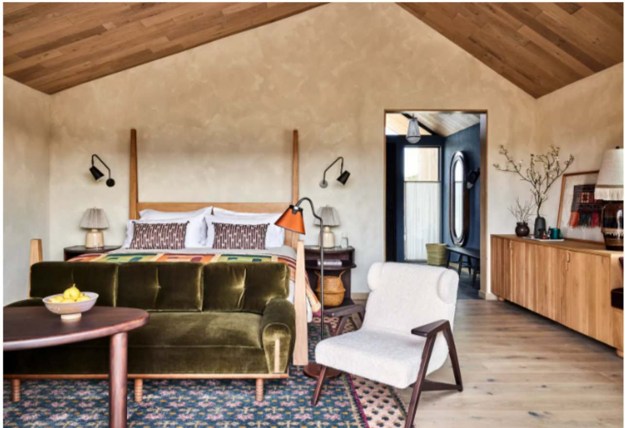
Wildflower Farms, an Auberge Resort, opened in late 2022 with a farmhouse-style spa.