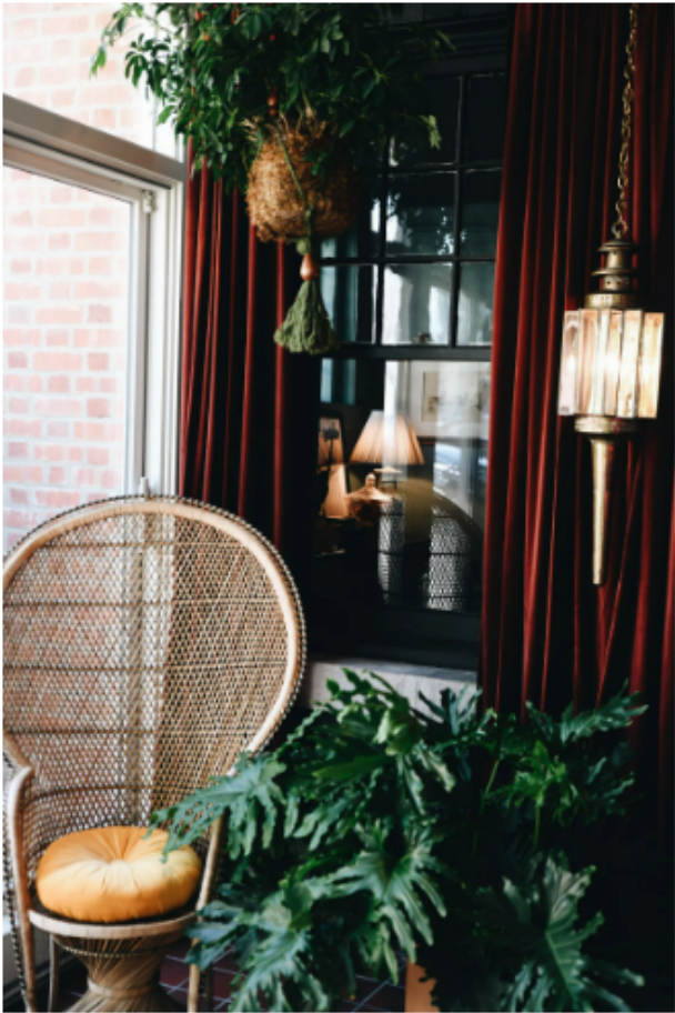
The Truitt sits adjacent to Country Club Plaza, an area of art museums and upscale shopping. The Truitt