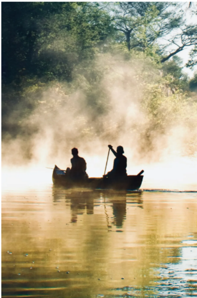
Canoe excursions and Seminole-style eco camps tread lightly on the Everglades ecosystem.