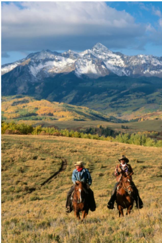
The picturesque Colorado mountain town of Telluride will celebrate several 50th anniversaries in 2023, from ski-season favorites to festivals.