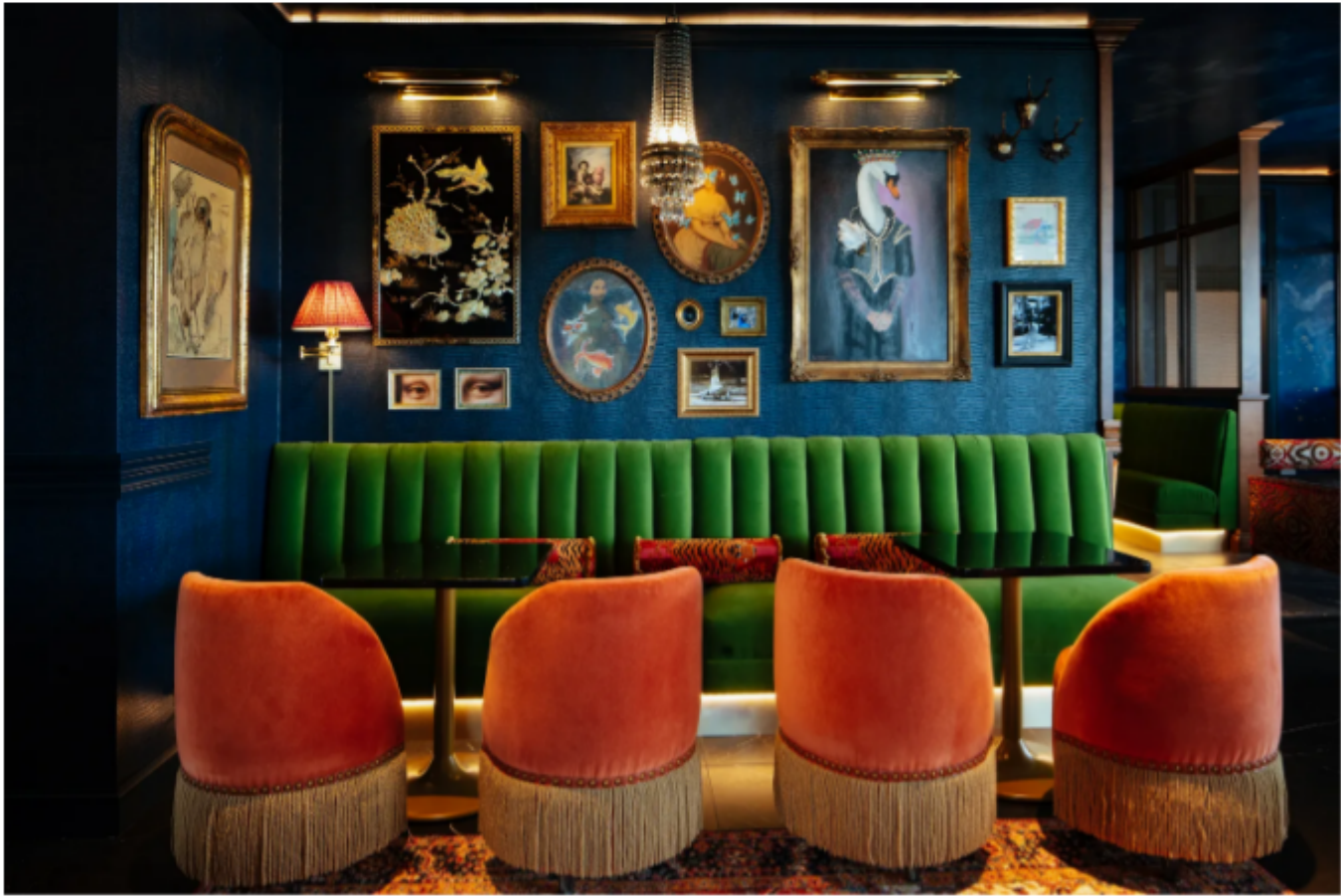
The Memphian Hotel shines a light on the city’s heritage through design and cuisine.

Nashville claims a lot of national buzz, but the city of Memphis has been quietly reshaping itself to be the hottest destination in Tennessee. Over the past decade, its downtown has invested billions in revitalization projects—and now, visitors can begin reaping the benefits.