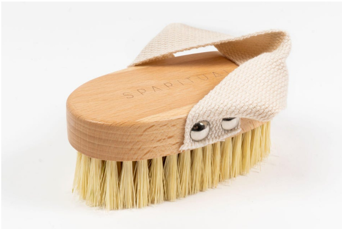
Sparitual Dry Brush SPARITUAL

Exfoliating your body with Sparitual's dry brush is not only a physical way to tap into mindfulness—it'll make you glow from head to toe. The sisal hemp bristles gently sweep away dead skin cells, which tend to accumulate in the arid environments of airplanes. The self-care practice of dry brushing is like an