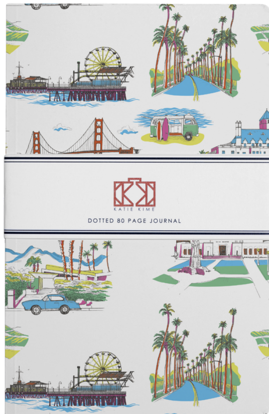
Katie Kime Travel-Inspired Journal KATIE KIME