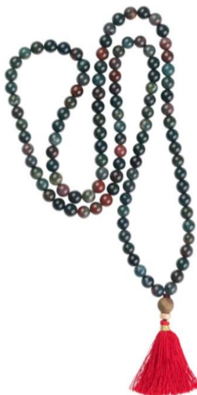
Civetta Bloodstone Mala Beads CIVETTA