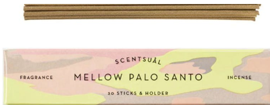
Scentsual Palo Santo Incense and Holder NIPPON KODO

Help a traveler set the right atmosphere for meditation and mindfulness with this giftable incense from Scentsual. It includes 30 sticks infused with the fragrance of sacred palo santo, along with an elegant floral incense holder that can be tucked away in even the smallest travel bag. Lighting this incense is the perfect way to reflect and unwind after a day of sightseeing. $5.60 at nipponkodostore.com