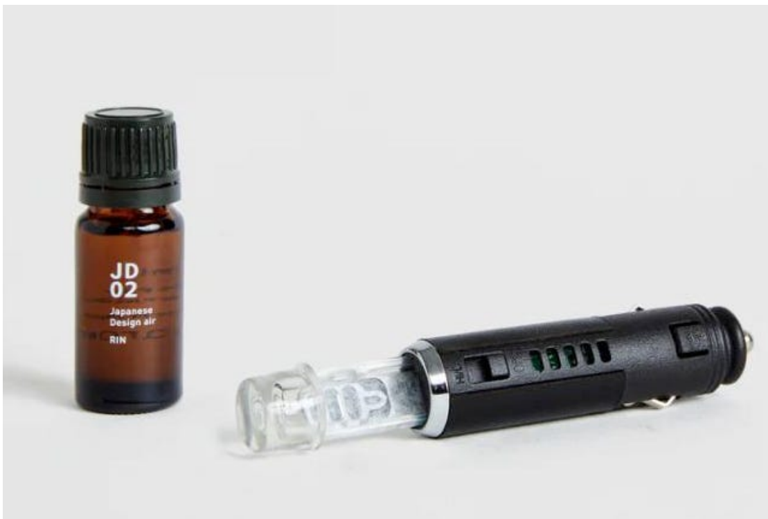
Essential Oil Diffuser for the Car KONMARI

This essential oil diffuser is the ultimate gift for meditation and mindfulness on the road. The leather-handled diffuser turns the recipient's vehicle into a moving zen den, blanketing the space in an essential oil fragrance of their choice. Just plug it into the car's power outlet, squeeze in a few drops of the oil, and ease into your most relaxing road trip yet. $29 at konmari.com