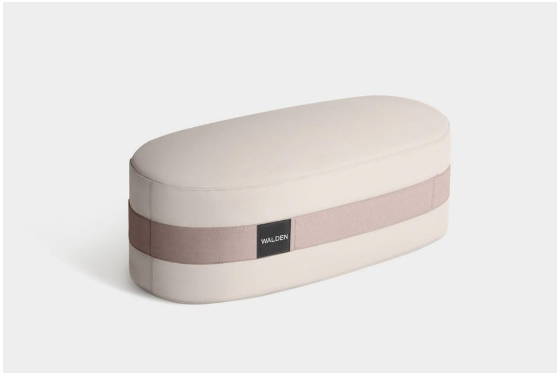
Walden Travel Meditation Cushion WALDEN

Walden's travel meditation cushion gives a traveler a home base for meditation anywhere in the world. The 4-pound mat's buckwheat-hull fill topped with gel-infused memory foam creates a comfortable, supportive foundation for a seated practice. Plus, the sleek antimicrobial cover is resists moisture, so it's sure to stand up to frequent travels. Choose from eight serene colors, like forest green, cobalt blue, and clay. $115 at walden.us