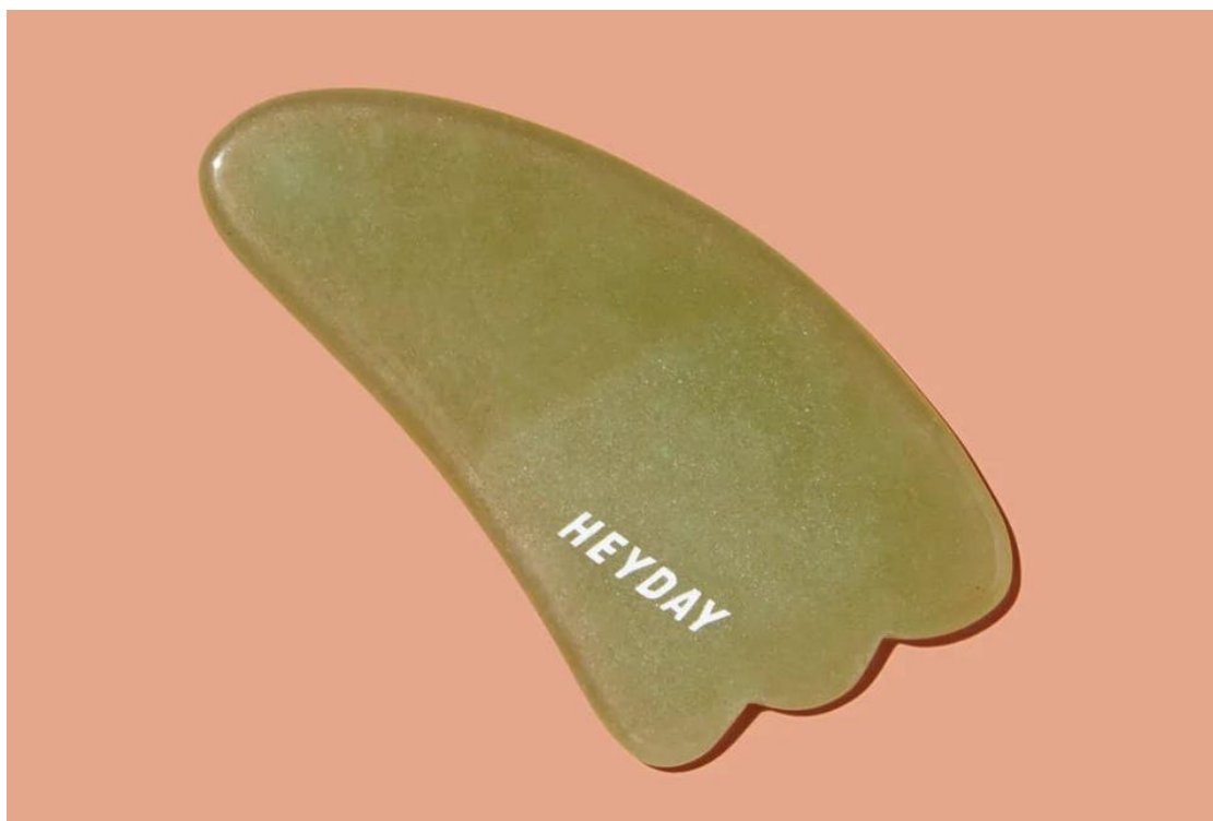
Heyday Gua Sha Tool HEYDAY