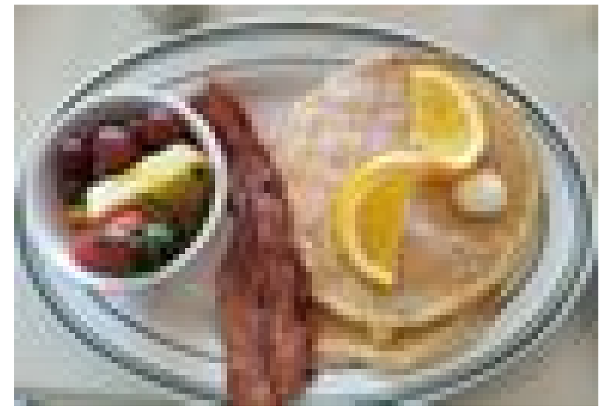
Pancake platter at the Guenther House