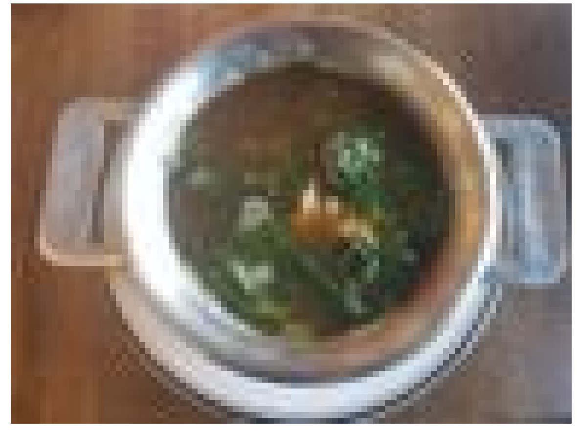
Chicken and vegetable soup at Supper ADRIENNE JORDAN