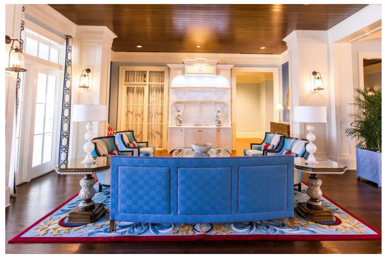
The overall design and vibe is warm, cheerful, and preppy, as evidenced by the lobby's cobalt blue sofas and coral-patterned rugs. The BEACH CLUB AT CHARLESTON HARBOR RESORT AND MARINA

boutique hotel, has been hosting discriminating guests seeking a more serene and scenic side of the Holy City.