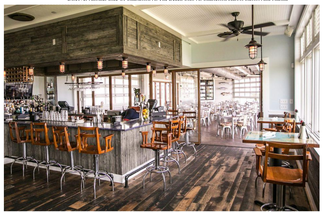
Popular with hotel guests and locals alike, the Fish House matches views of the harbor with an expansive menu. THE BEACH CLUB AT CHARLESTON HARBOR RESORT AND MARINA