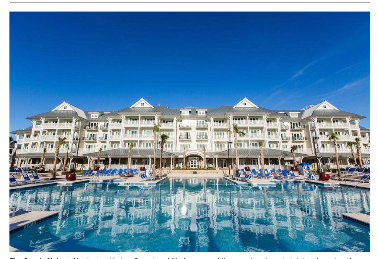
The Beach Club at Charleston Harbor Resort and Marina, a sparkling new boutique hotel, has been hosting discriminating guests seeking a more serene, but equally sophisticated side of the Holy City. THE BEACH CLUB AT CHARLESTON HARBOR RESORT AND MARINA

As most travelers already know, the Southern charms of Charleston are aplenty. No wonder it's been such a popular destination for years. But for those seeking a slightly less traversed path, why not cross the famed Arthur Ravenel Jr. Bridge to Charleston Harbor in Mount Pleasant? The inlet offers up refreshingly different views of Charleston (quite literally), while providing easy access to all of the city's beloved restaurants, bars, and cultural points. And as of November of last year,