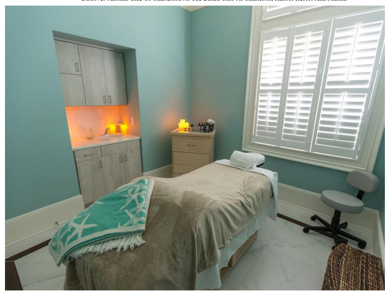
The Estuary Spa is a cozy jewel box of spa, where relaxation and rejuvenation are in order. THE BEACH CLUB AT CHARLESTON HARBOR RESORT AND MARINA