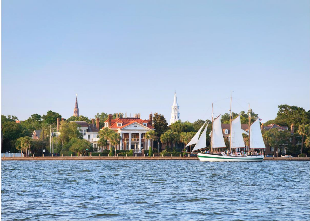
Water views abound in Charleston.