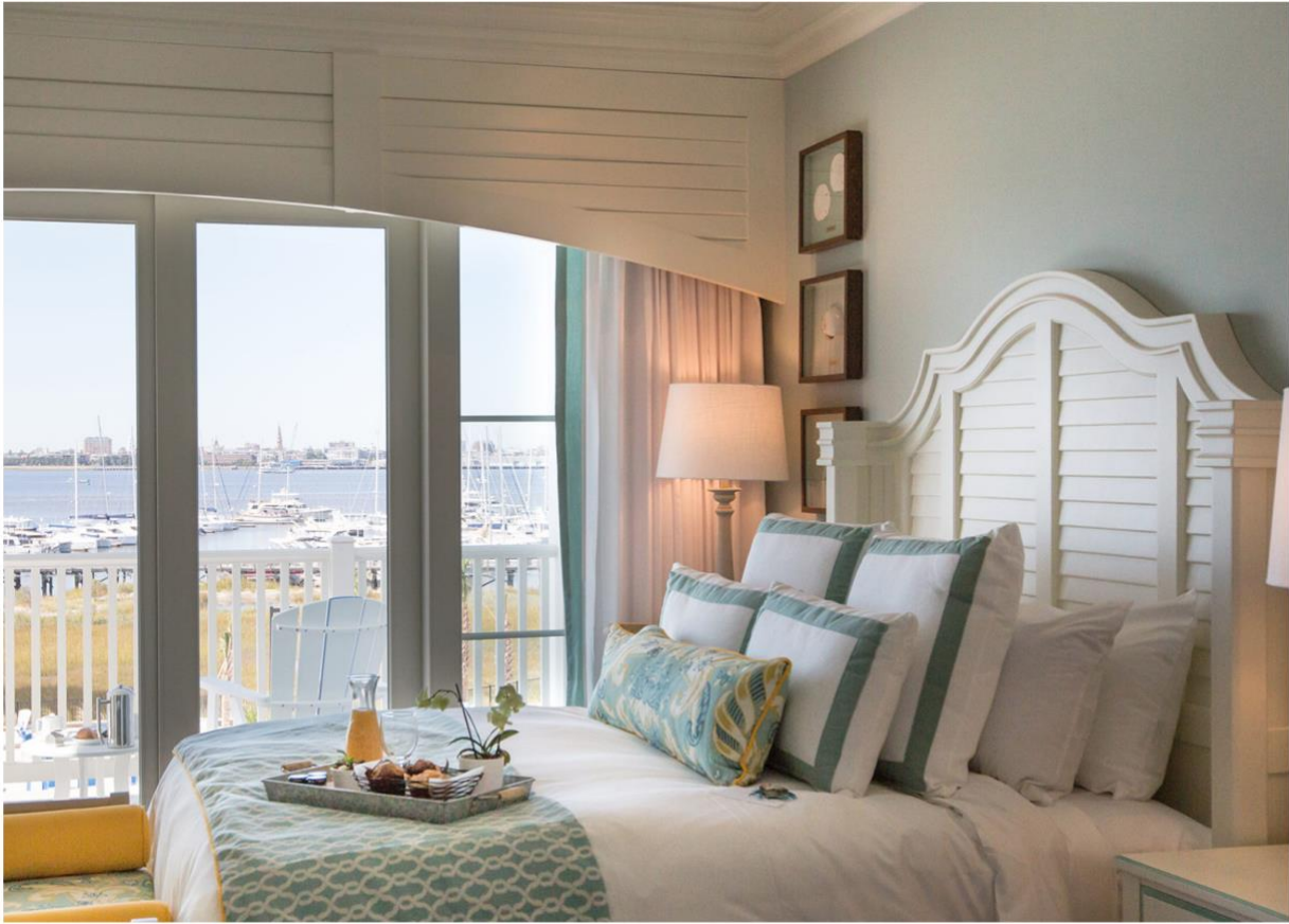
A room with a view at The Beach Club.

Charleston captivates visitors with myriad churches (earning it the nickname of the Holy City), antebellum mansions, red-brick Georgian houses, landscaped gardens, and live oaks laden with Spanish moss. Its lively streets brim with antiques shops, indie fashion boutiques, and some of the country's most acclaimed restaurants dishing up Low Country fare. The city is seemingly meant for afternoon and evening strolls – none more so than on the second Sunday of each month, when main thoroughfare King Street closes to cars and becomes the social hub for this consummate Southern pastime.