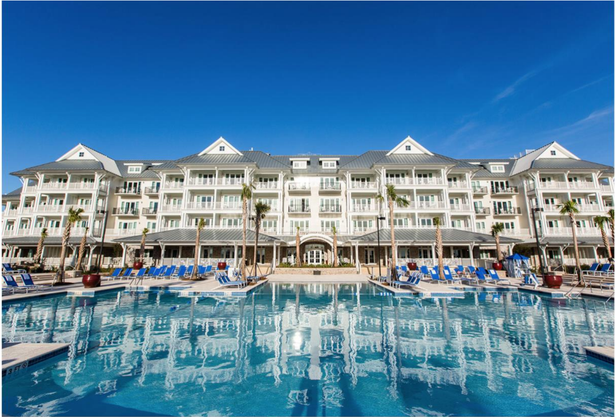
The pool at The Beach Club.