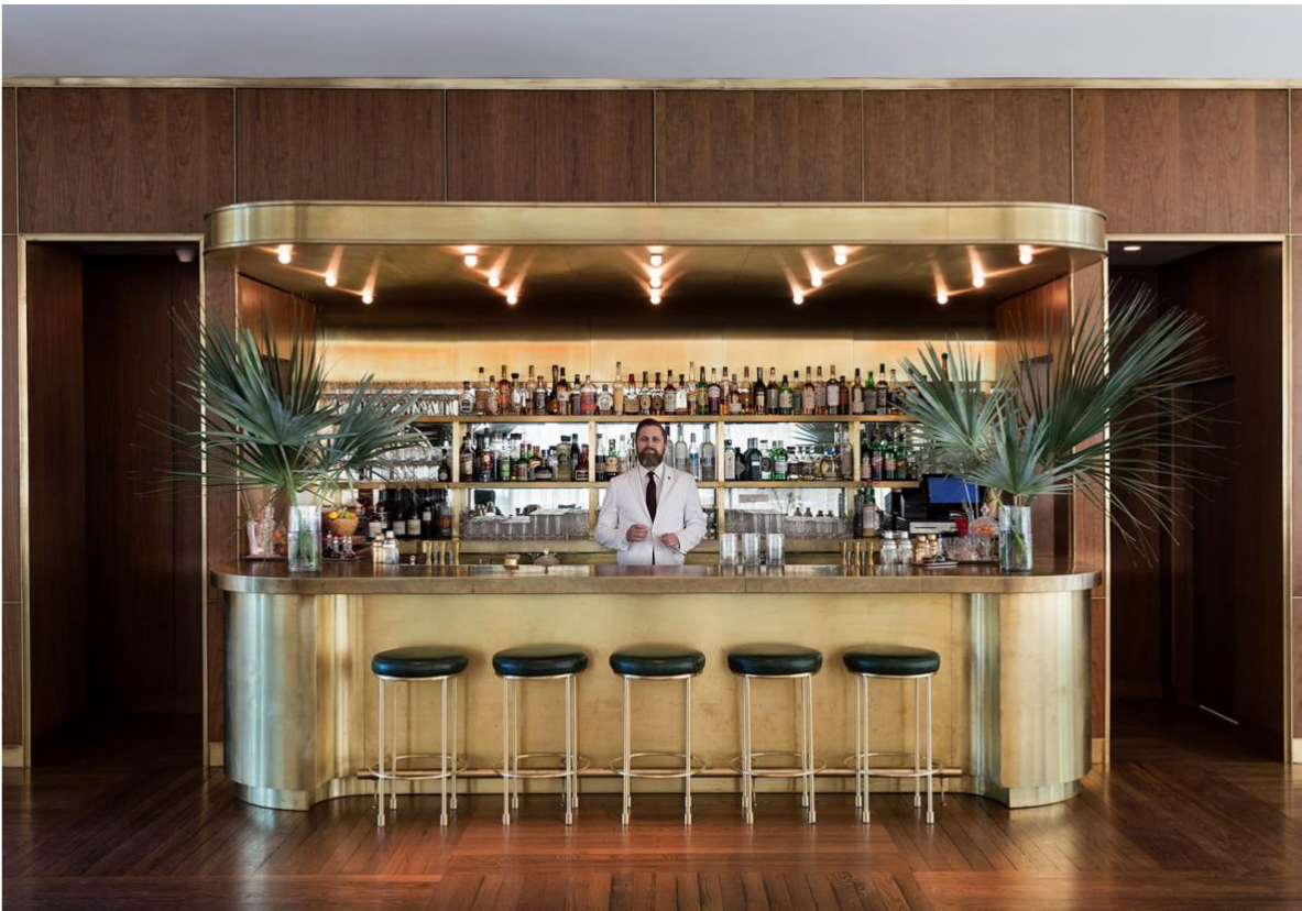
Drinks at Living Room bar.

You might crave Southern-style sweet tea, but when you want more, belly up to the bar at Living Room , where Ryan Casey mixes what many claim is the town's top old fashioned. At 5Church , tipping takes a sacred turn. The refurbished church, enlivened by vaulted ceilings and original stained-glass windows for brunch, is the home to sinfully good Bloody Marys – drink enough and you may find yourself reading the entire text of The Art of War , which is artistically scrawled on the wall.